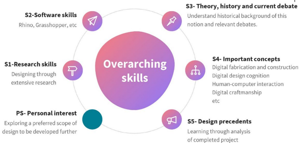
Figure 2. Overarching skills, communicated in Week 1